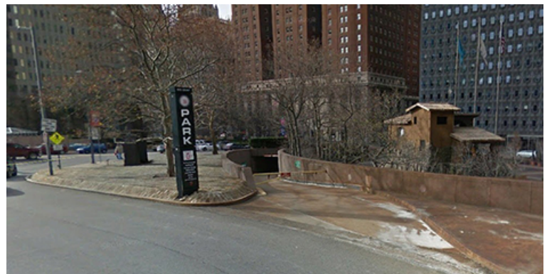
Parking garage entrance from the Sixth Street exit of the Veteran's Bridge.